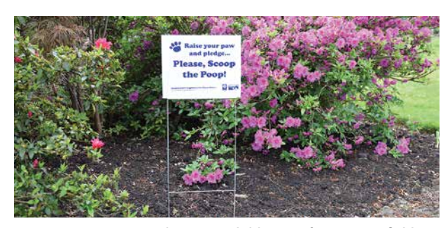
Anyone can post a yard sign, available FREE from Springfield's Stormwater Team, to share that we care.