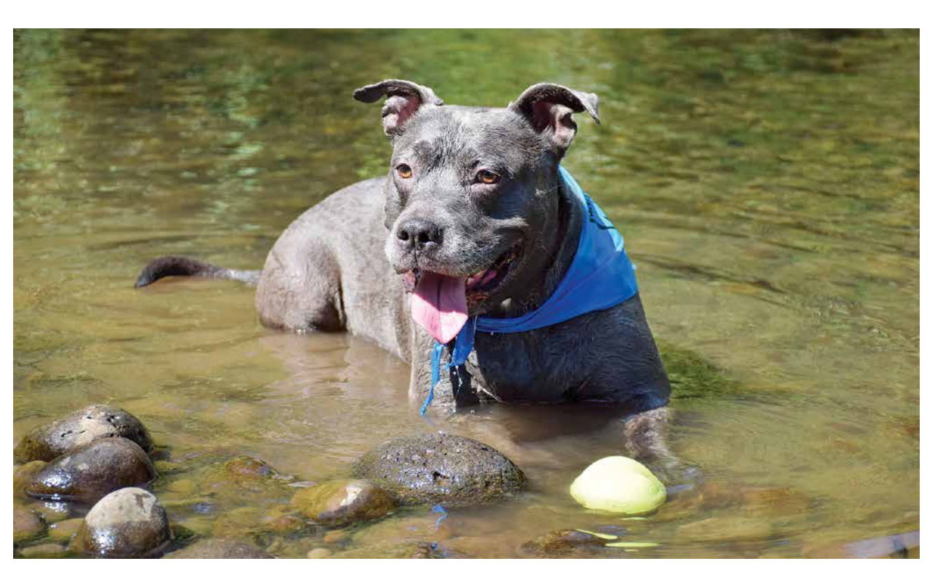
Freya, a 4-year-old American Pit Bull Terrier, loves playing in a creek near Elijah Bristow State Park with her favorite ball!