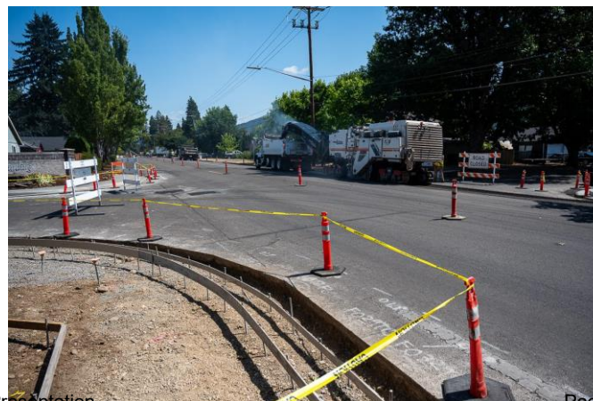
Capital Budget Presentation