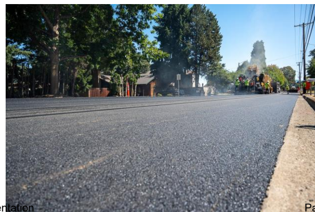
Capital Budget Presentation