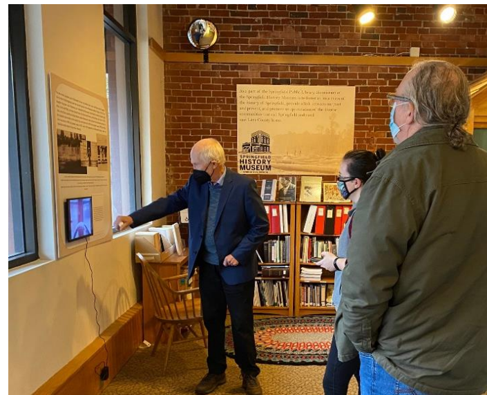
The Museum's Glenwood Untold exhibit runs through June 24, 2022.