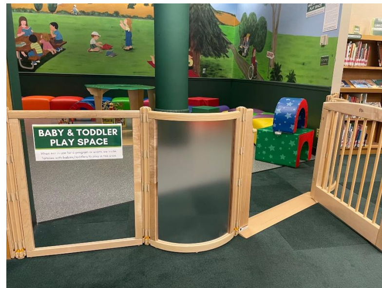
Renovated play & program space with funding from the Library Foundation and community donations.