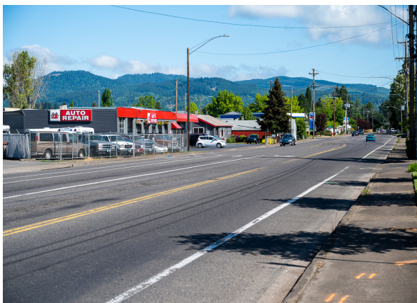
42nd St Before