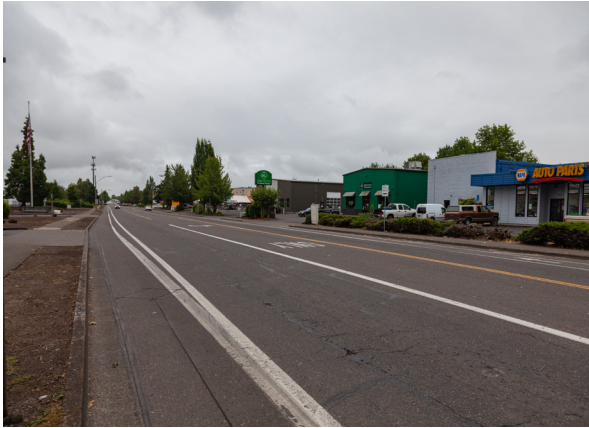
Olympic St Before