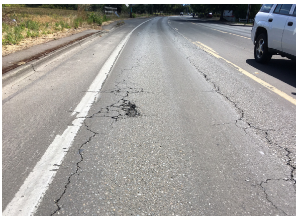
Highbanks Rd Before