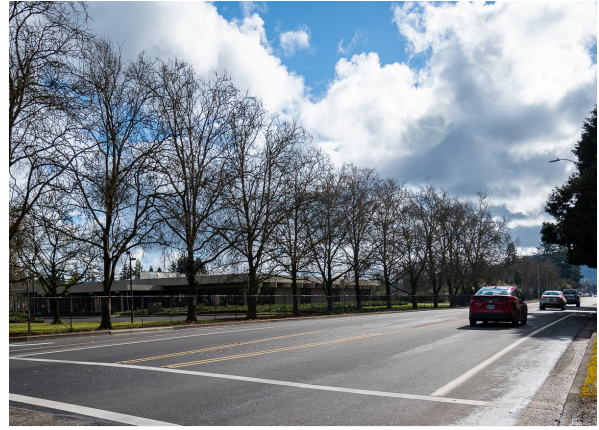
42nd St After