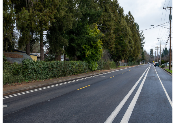
Thurston Rd After