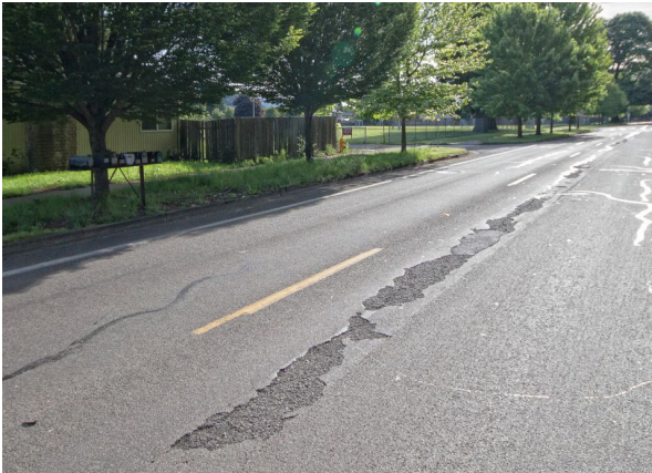
Thurston Rd Before