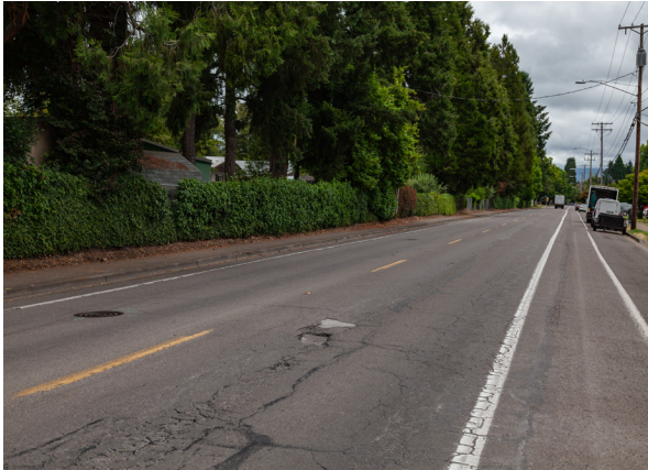
Thurston Rd Before