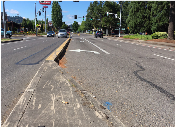
Mohawk Blvd Before