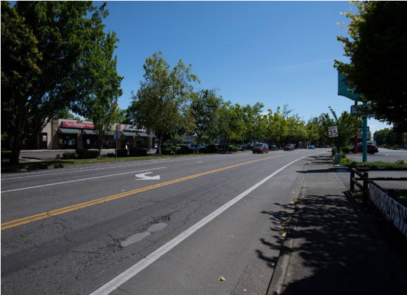
Olympic St Before

The following are before and after photos of each of the streets repaired in 2021. To stay apprised of bond measure street repair projects, visit the City's website at springfield-or.gov or follow us on social media.