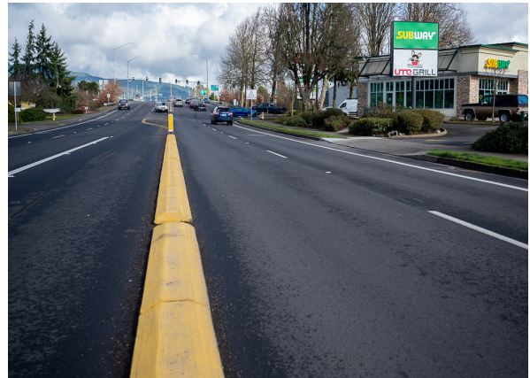
Mohawk Blvd After