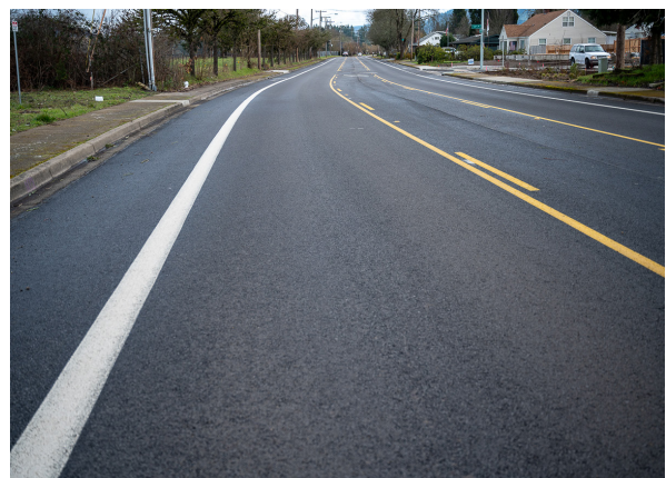
Highbanks Rd After