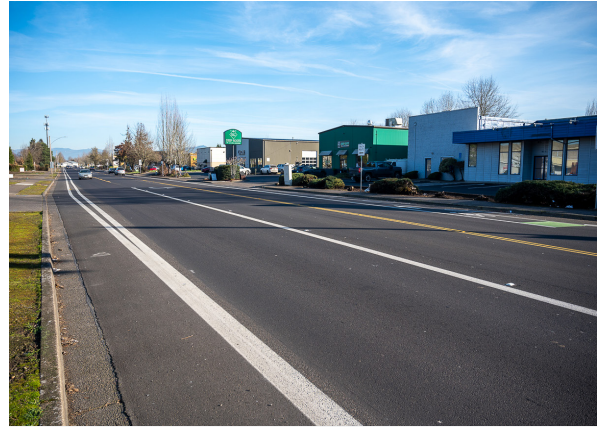
Olympic St After