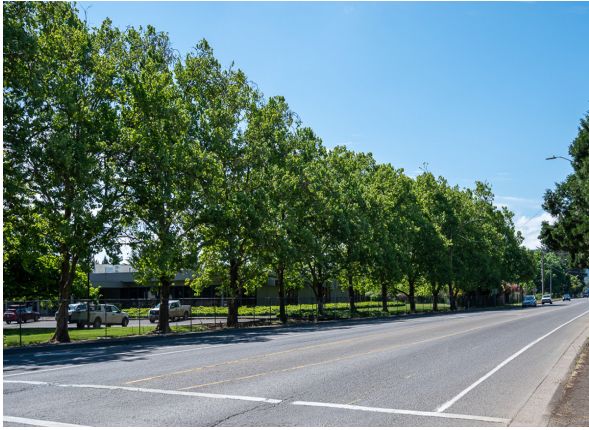
42nd St Before