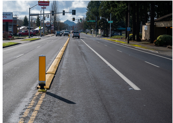
Mohawk Blvd After