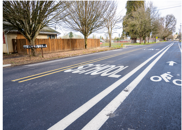
Thurston Rd After