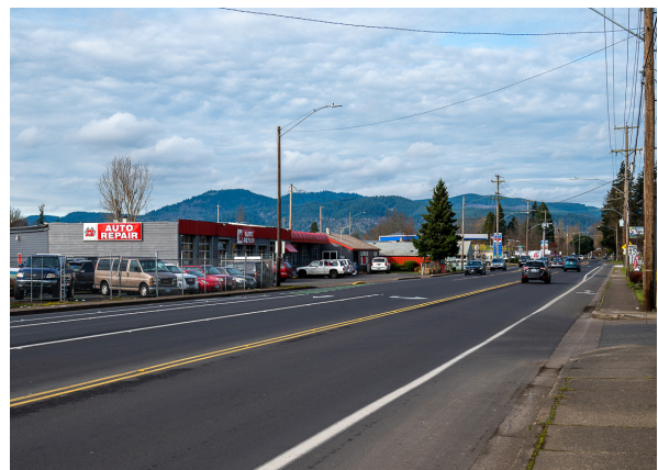
42nd St After