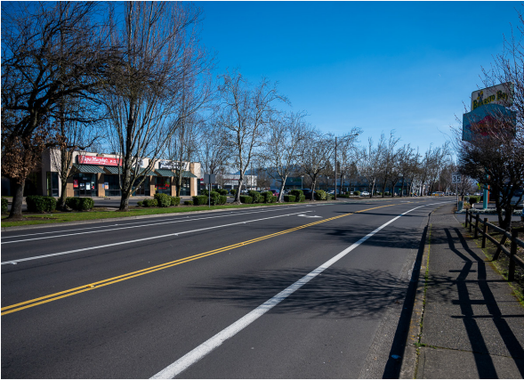
Olympic St After