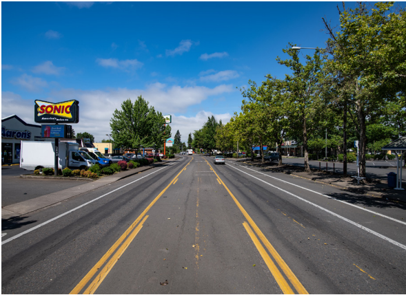
Olympic St Before