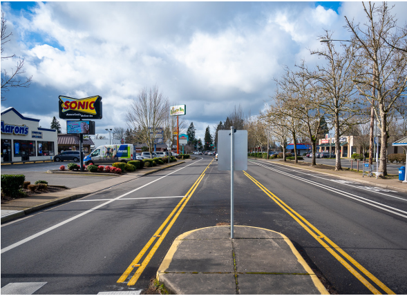
Olympic St After