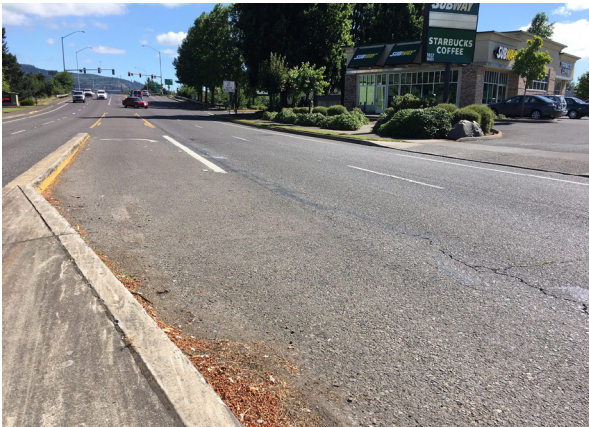
Mohawk Blvd Before