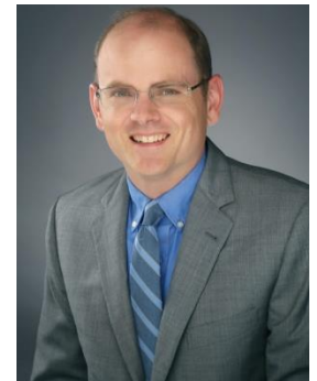
Mayor Sean VanGordon