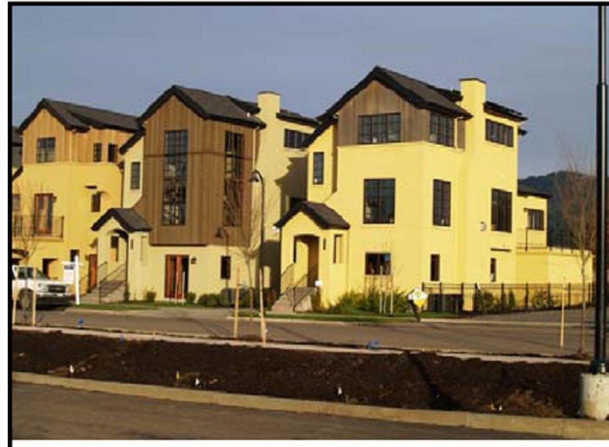
Crescent Village (Eugene)