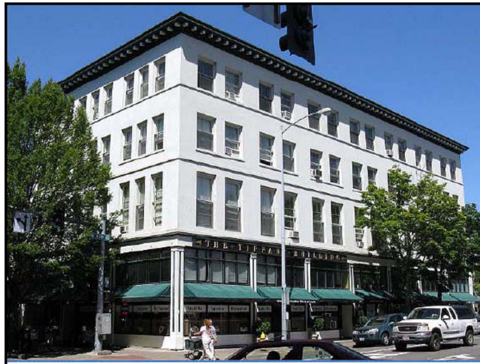
Tiffany Building (Eugene) 18 units @