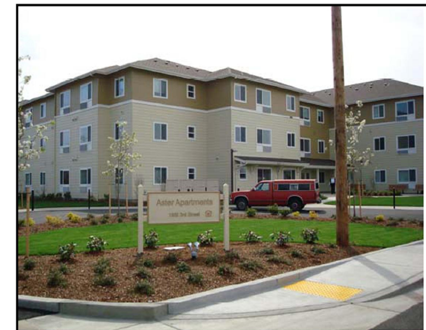
Aster Apartments Affordable Senior Housing Springfield, OR