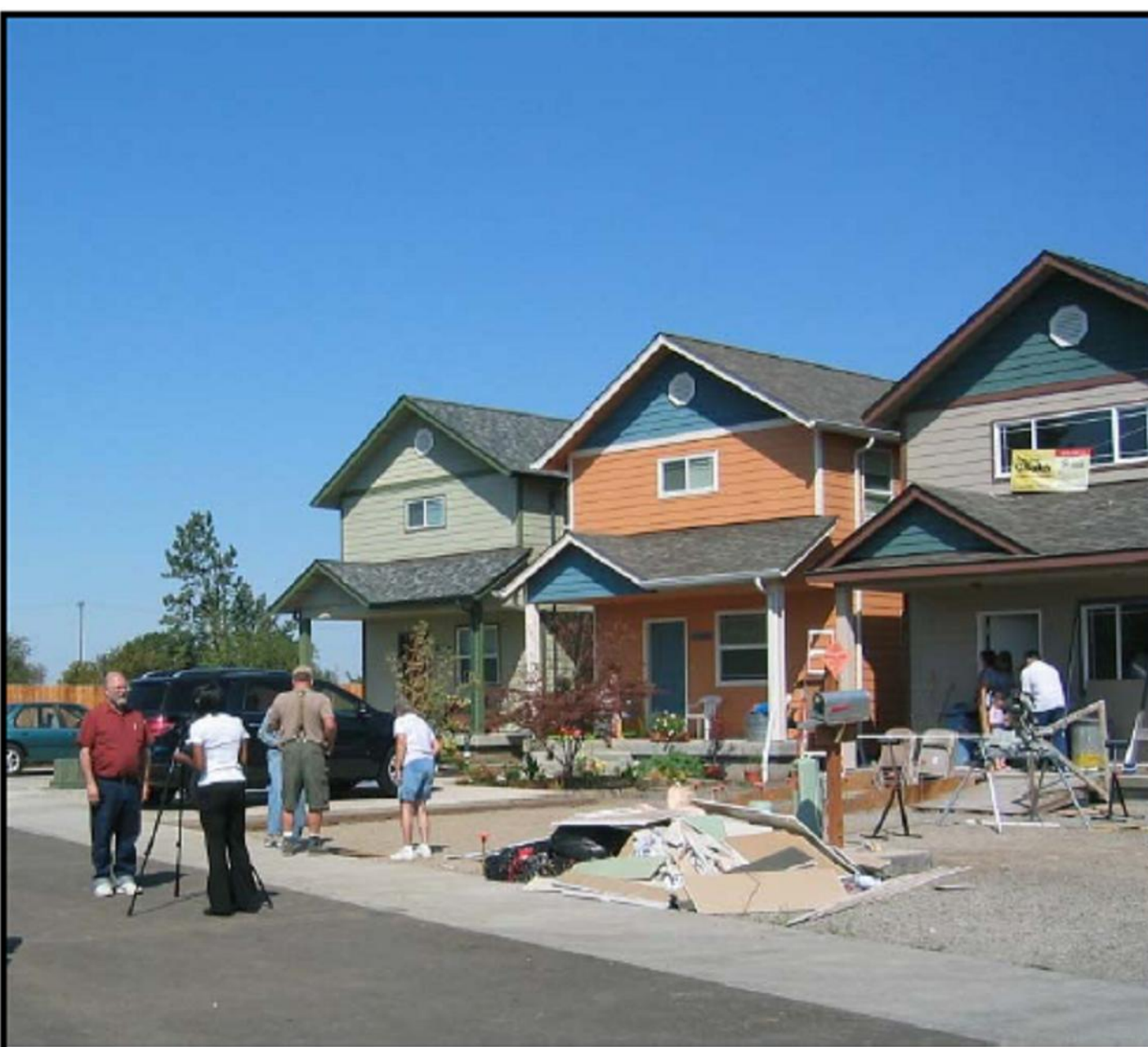
Habitat for Humanity Springfield OR

Examples of Medium Density Housing Types