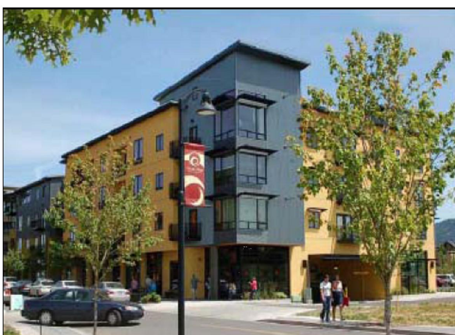
Crescent Village (Eugene) 68 units per net acre