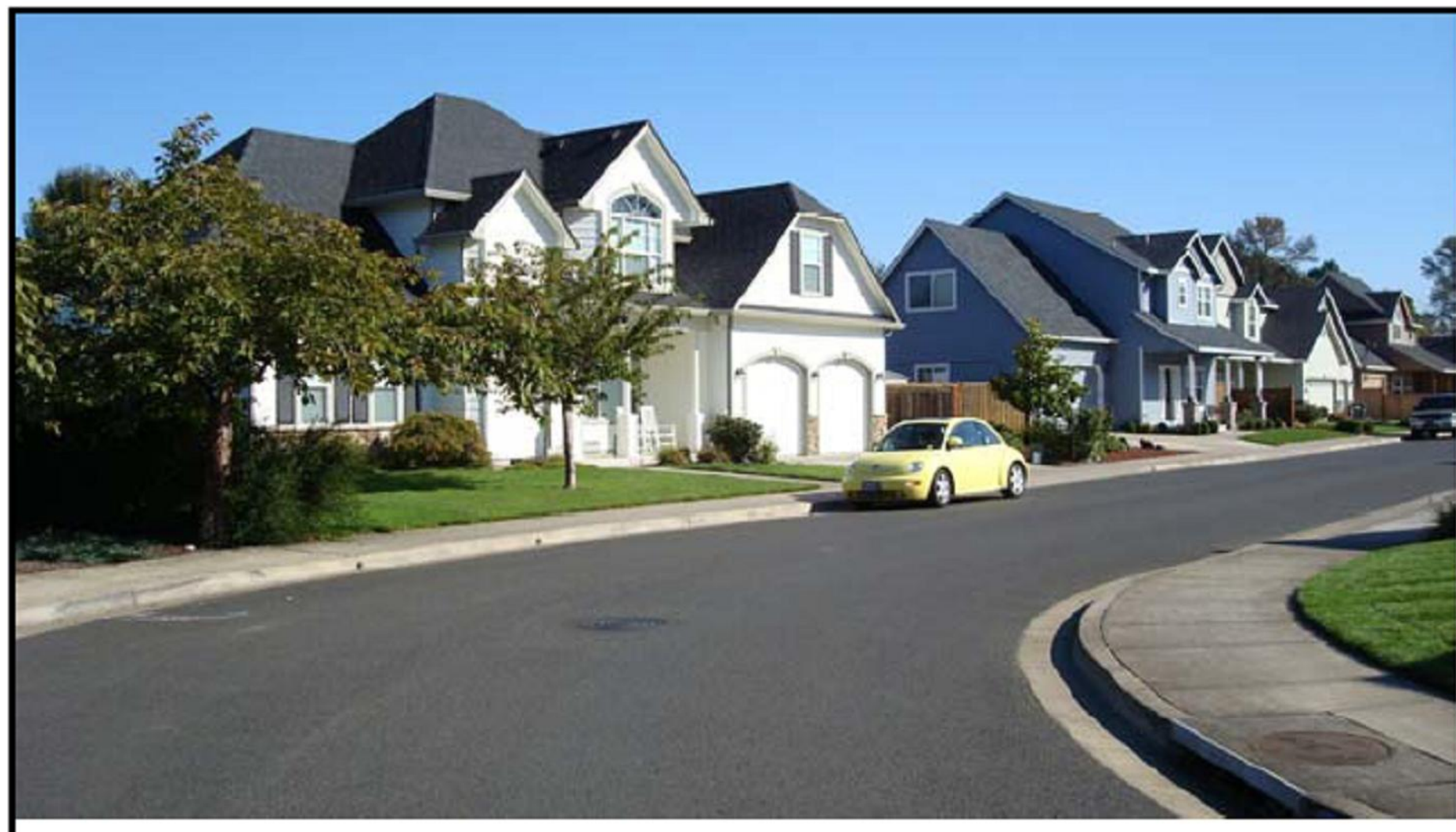
Levi Landing, Springfield, OR