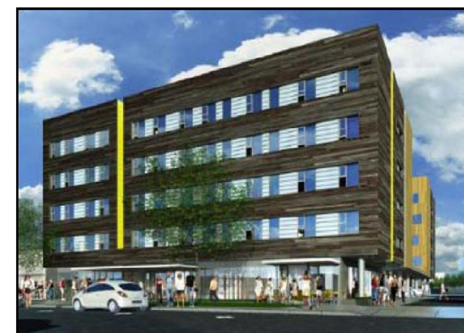
Courtside Apartments (Eugene) 4 stories above commercial 109 units per net acre

Examples of High Density Housing Types – Mixed Use