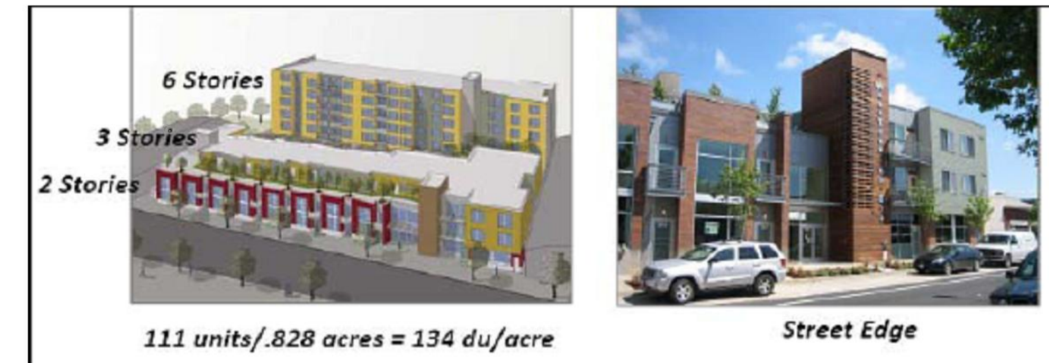
West Town Live-Work Housing