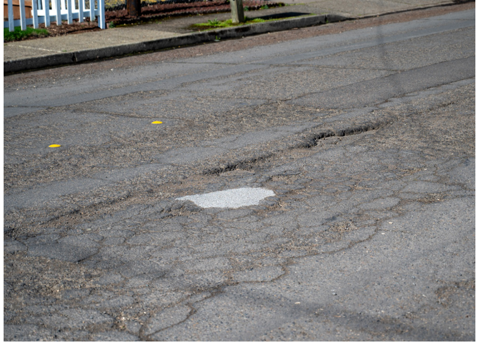
36th Street from Main Street to Commercial Avenue