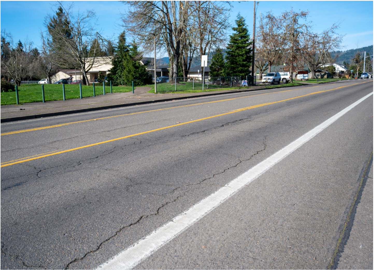
58th Street from Main Street to Thurston Road