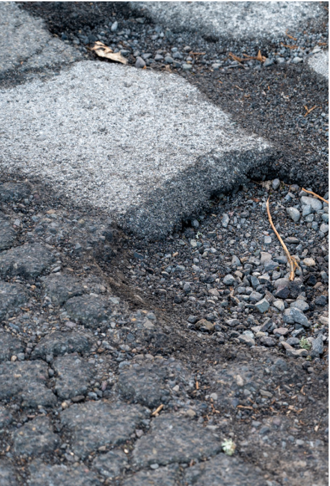
Aspen Street from Tamarack Street to Centennial Boulevard