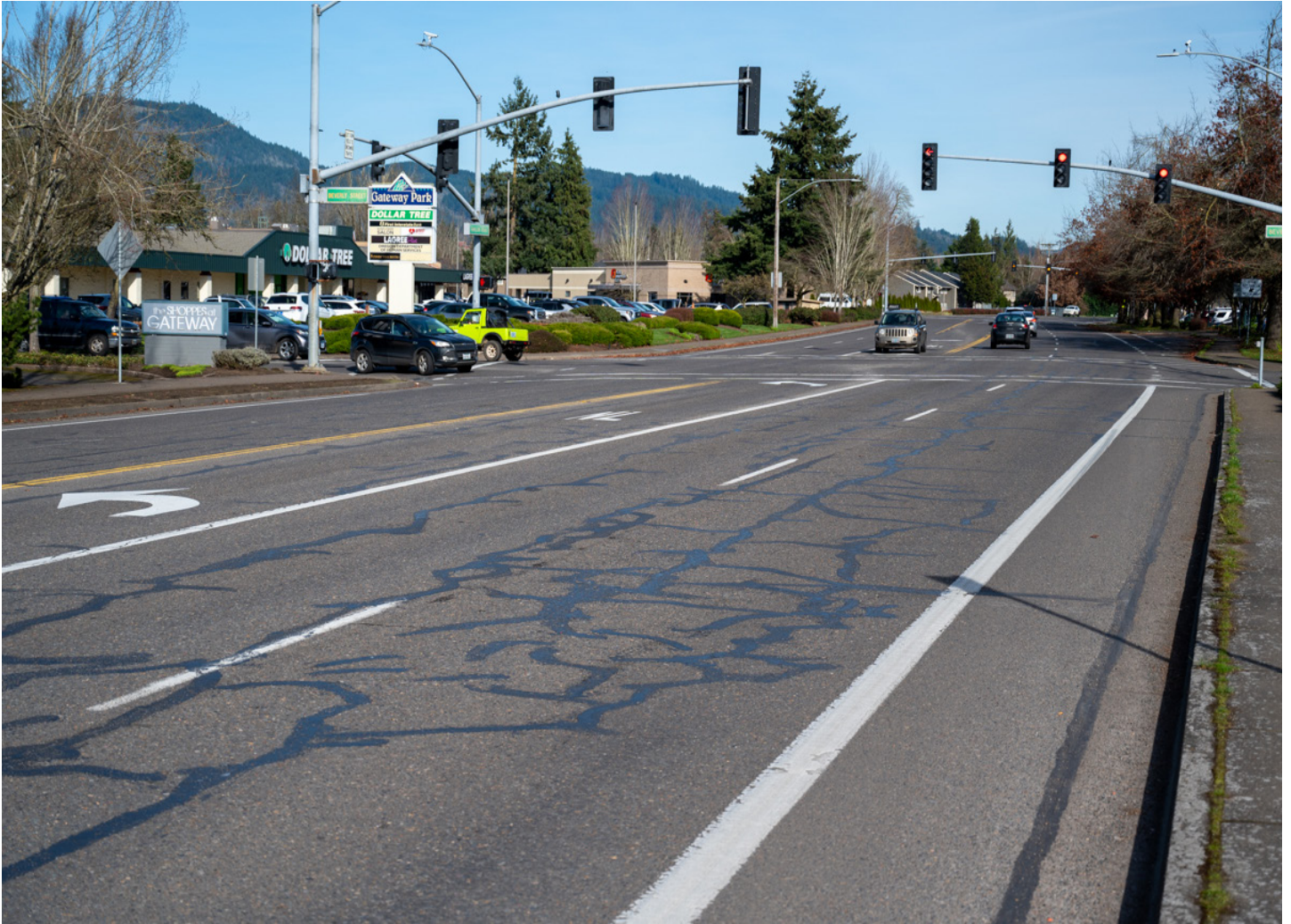
Harlow Road from Interstate 5 to the roundabout at Pioneer Parkway and MLK Jr. Parkway

Photos on front cover: (Top) 36th Street, (Bottom) Daisy Street