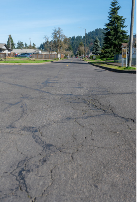
•Daisy Street from South 51st Place to Bob Straub Parkway