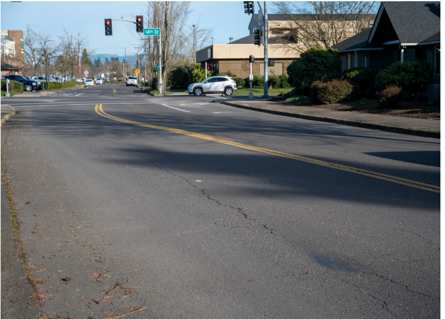
G Street from 10th to 23rd Street